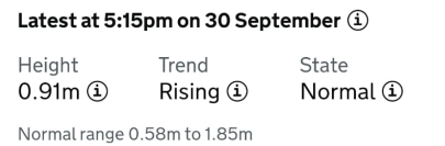
Height in metres over the last 5 days and up to 36 hour forecast

transit truck had cloned our number plates and after some correspondence with the police they have revoked the ticket and apologised. Just some of the admin that we have to deal with now.