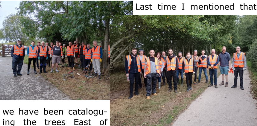
Last time I mentioned that

we have been cataloguing the trees East of Hopwell Road. We've now sorted out the summary and identified those that are dead or dangerous. Roger's forestry team have now taken them down and we've had corporate teams from Rolls Royce to work at clearing out some of the undergrowth so we can be ready for the next stages, particularly near the old winding hole.