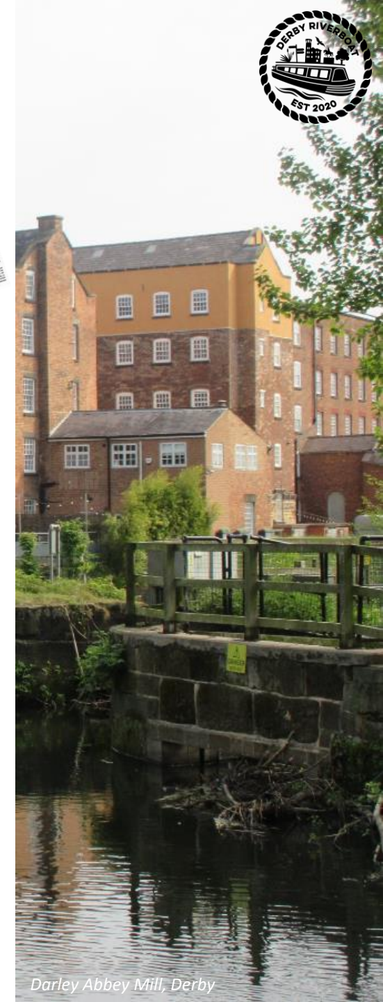
Darley Abbey Mill, Derby

ALL WEATHER CRUISING: Passengers can choose between indoor and outdoor seating areas. So whether you decide you want to relax in the fresh air on the foredeck on a hot and sunny day or retreat to the covered, warm cabin when it's cooler the choice is yours. All areas of the boat are fully accessible to wheelchair users.