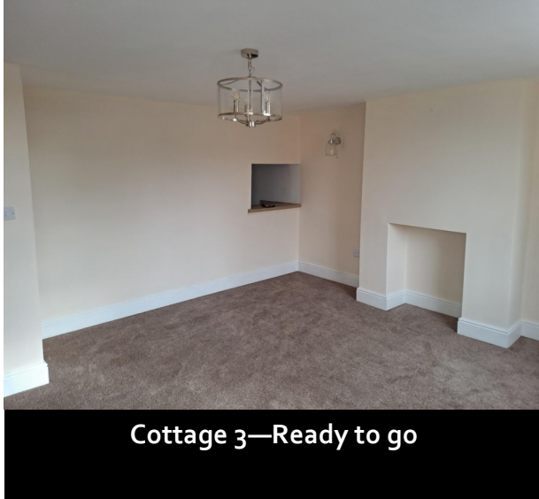
Cottage 3—Ready to go

On the very positive front we are motoring on with the flood recovery works. As anticipated we completed Cottages 2 and 3 at the end of February and are now well into Cottage No 1. It's much faster when you've done it all before and we've been able to bring back the trades we need at exactly the right time so far! We've also