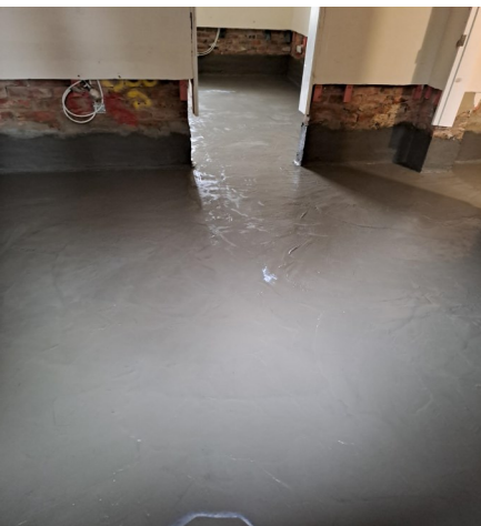
Tanking in place