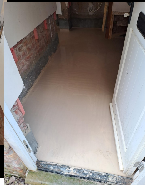
New screed laid