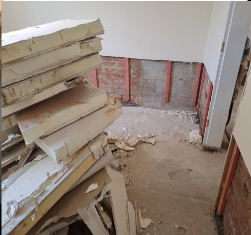
Removal of damp plasterboard

finished in a few weeks. As before, if anyone wants to paint then we'll be starting in the week after Easter. The happy band of volunteers were reduced by one with Tony taking a holiday and having a knee operation, but the op went so well he's back on the job already. That's dedication for you.